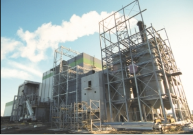
Port of Antwerp, Belgium - SEGHERS waste-to-power plant 150 MWth Power plant

Our experience with salty and alkali-rich residues enables us to guarantee high performances for difficult biomass streams or biomass mixtures.