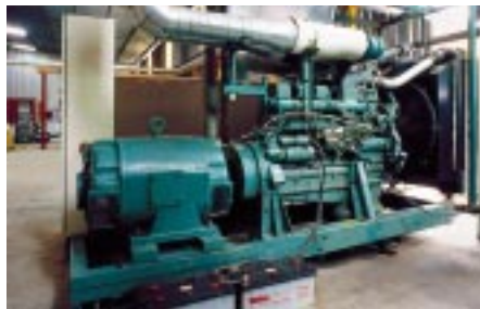
The plant has two internal combustion four-cycle engines that operate with the Dual-fuel system.

This way, during the 30 first months of operation, the facility was in service for over 15,000 hours