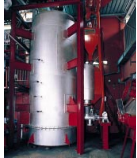
Thermal conversion from solid organic matter into gas takes place in the reactor-gasifier.

In view of the situation, in 1993, PERE ESCRIBÀ, SA studied various energy solutions to make the most out of almond shells. In 1994, their survey concluded in an ambitious research project to set up a gasification system that would allow operating with a small-sized reactor; it provided high energy performances and it was environmentally friendly. Three years afterwards, this project