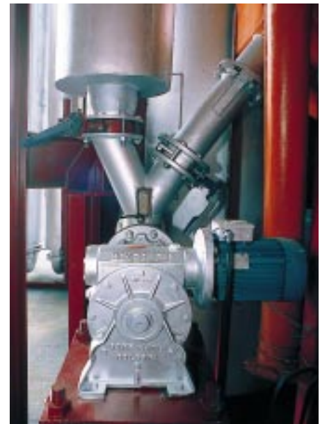
Almond shell grinder which feeds the reactor-gasifier.

operate at limited power, from 250 kW, and its priorities were safety, operation easiness and minimising maintenance costs.